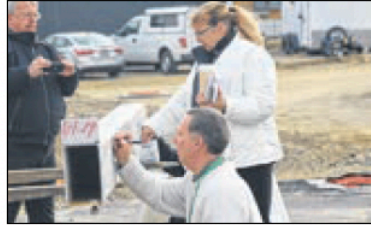
Employees and community members signed the steel beam before it was put into place.