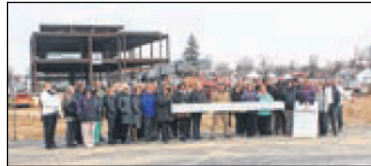
Wayne HealthCare employees and members of Shook Construction attended the topping-off ceremony to celebrate the final piece of structural steel being put into place.